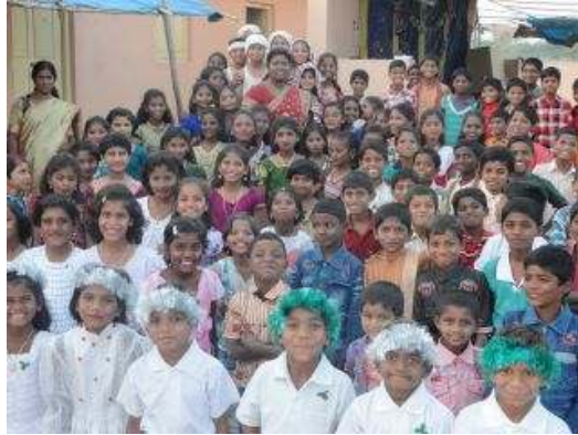
These are the children at Christmas time.