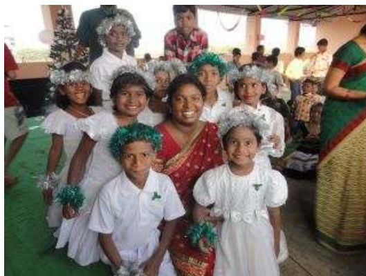
Some of the children at Christmas time. Extra donations at Christmas time allowed for them to have a special celebration.