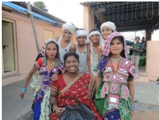
These are children from the Banjara Tribe. They are considered the lowest caste people in India. Sheba invited them from a nearby village.